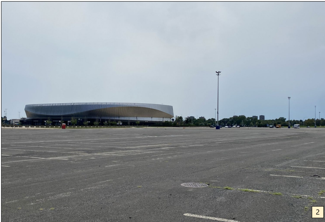
View of the subject property looking southwest towards the existing Coliseum building.