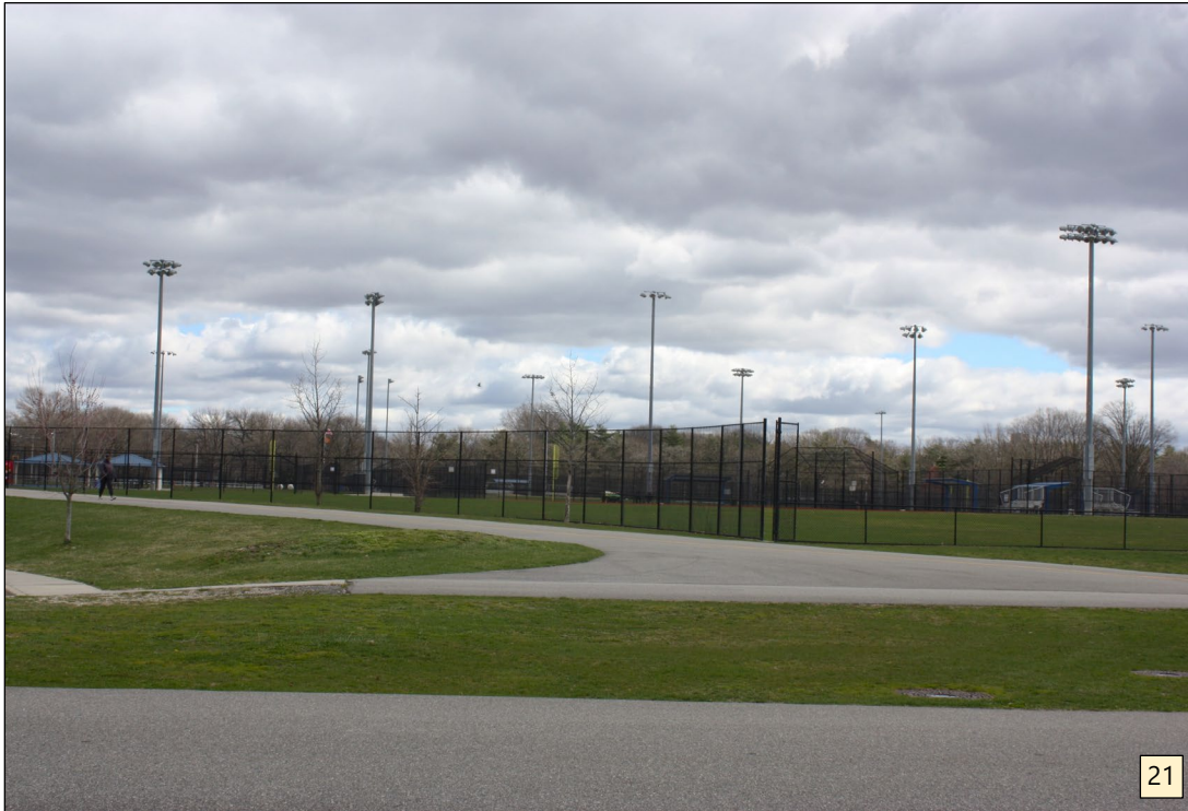
View looking east towards the southwestern ballfields within Eisenhower Park.

1255 Hempstead Turnpike and 101 James Doolittle Boulevard, Uniondale, Town of Hempstead, Nassau County