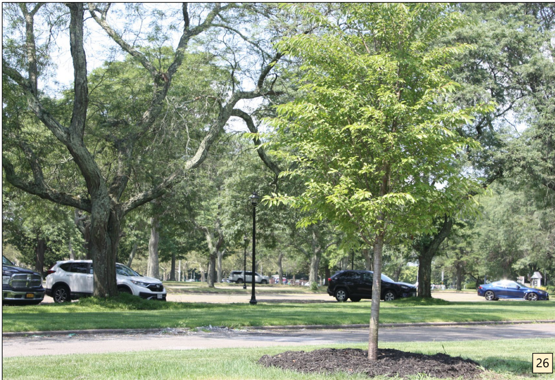
View looking southwest towards the subject property from the Carlton (former Salisbury Golf Course Clubhouse) within Eisenhower Park.