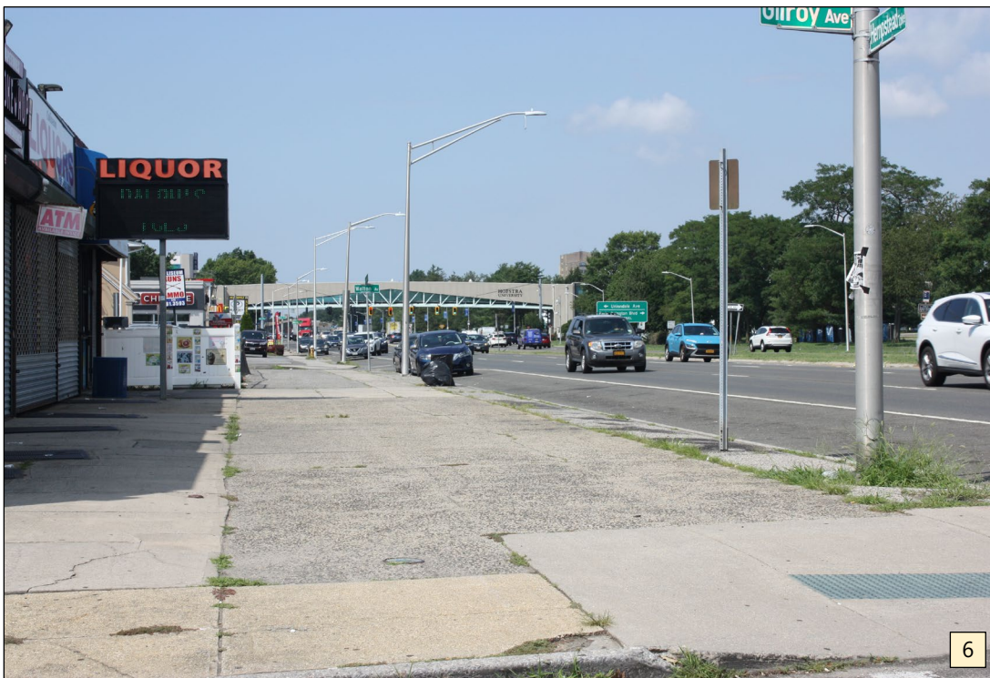
View looking west along the Hempstead Turnpike corridor at the intersection of Gilroy Avenue.