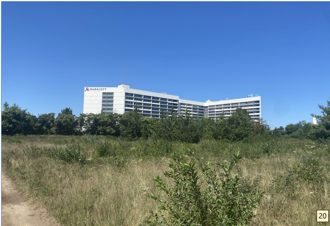
View looking west towards the subject property from within the Francis T. Purcell Preserve (Hempstead Plains).