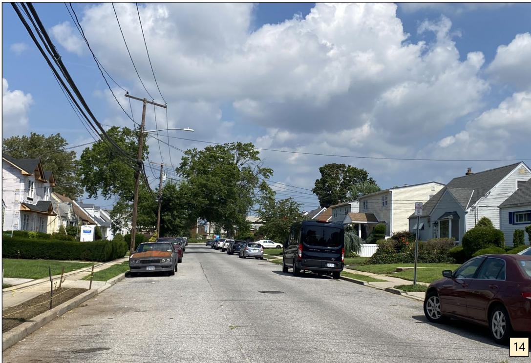
Image looking northwest towards the single-family residential homes on Gilroy Avenue.