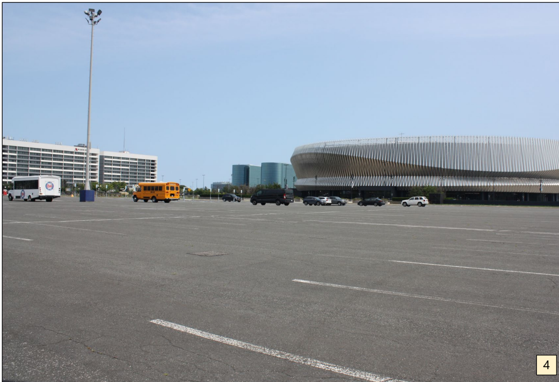
View of the subject property looking southeast towards the existing Coliseum building.