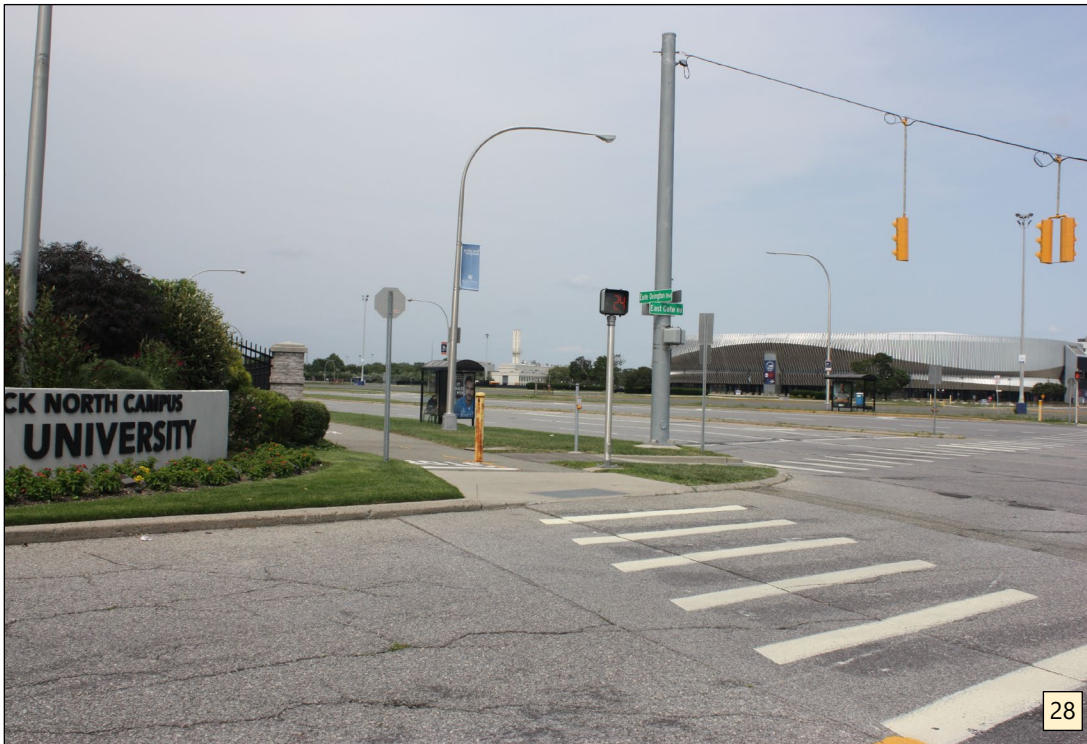
View looking northeast towards the subject property from the intersection of Earle Ovington Road and East Gate Road, the eastern entrance of Hofstra University.