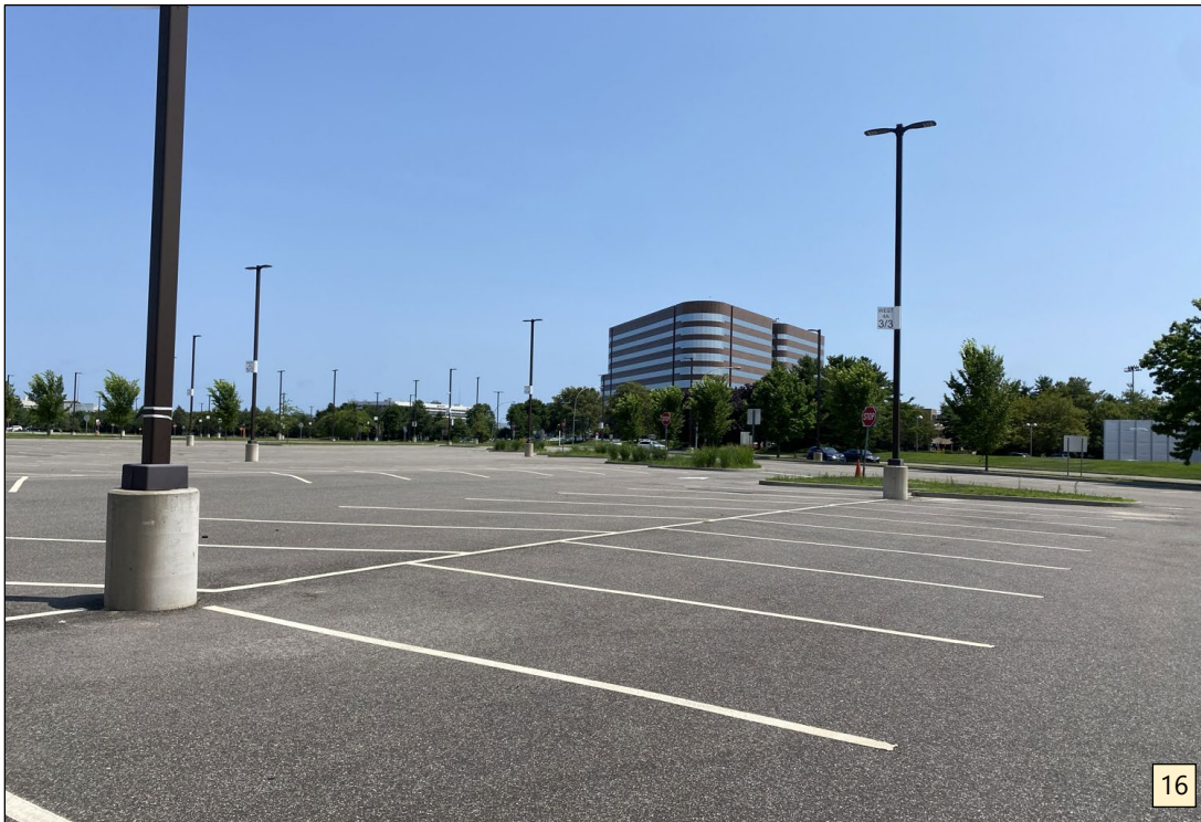
View looking southeast towards the subject property from Museum Row.