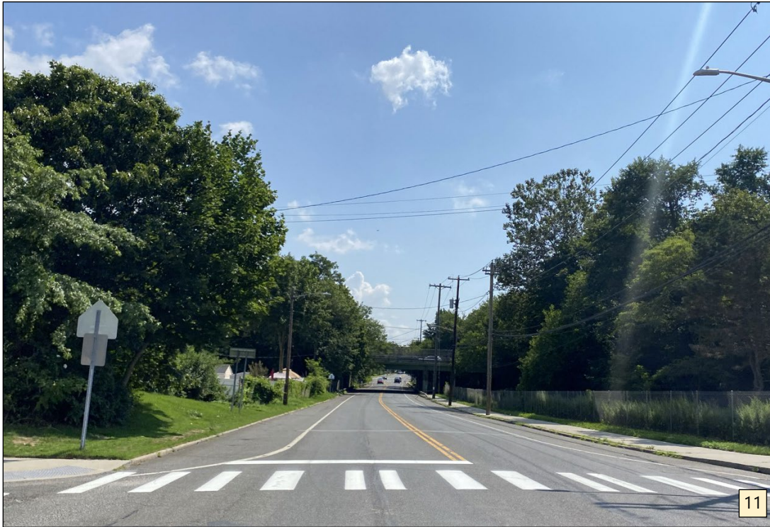
View looking west along the Front Street at the intersection of Compass Street towards the Meadowbrook State Parkway overpass.

1255 Hempstead Turnpike and 101 James Doolittle Boulevard, Uniondale, Town of Hempstead, Nassau County