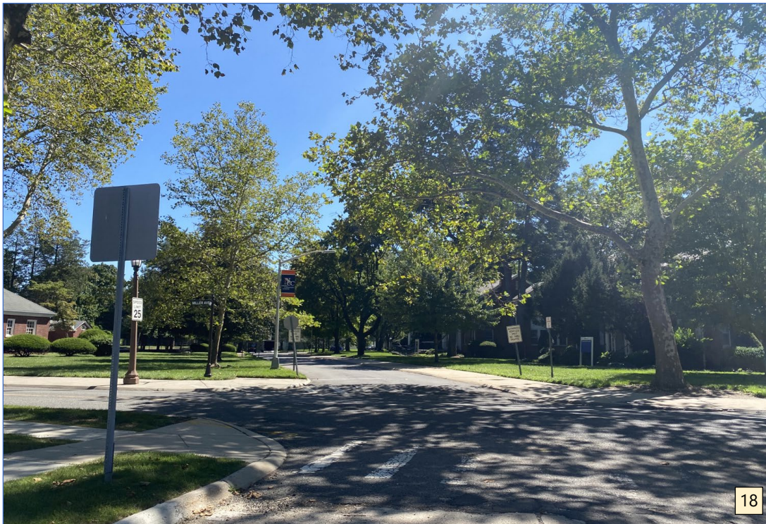
View looking south towards the subject property from the intersection of Bane Road and Miller Avenue within the Officers' Quarters.