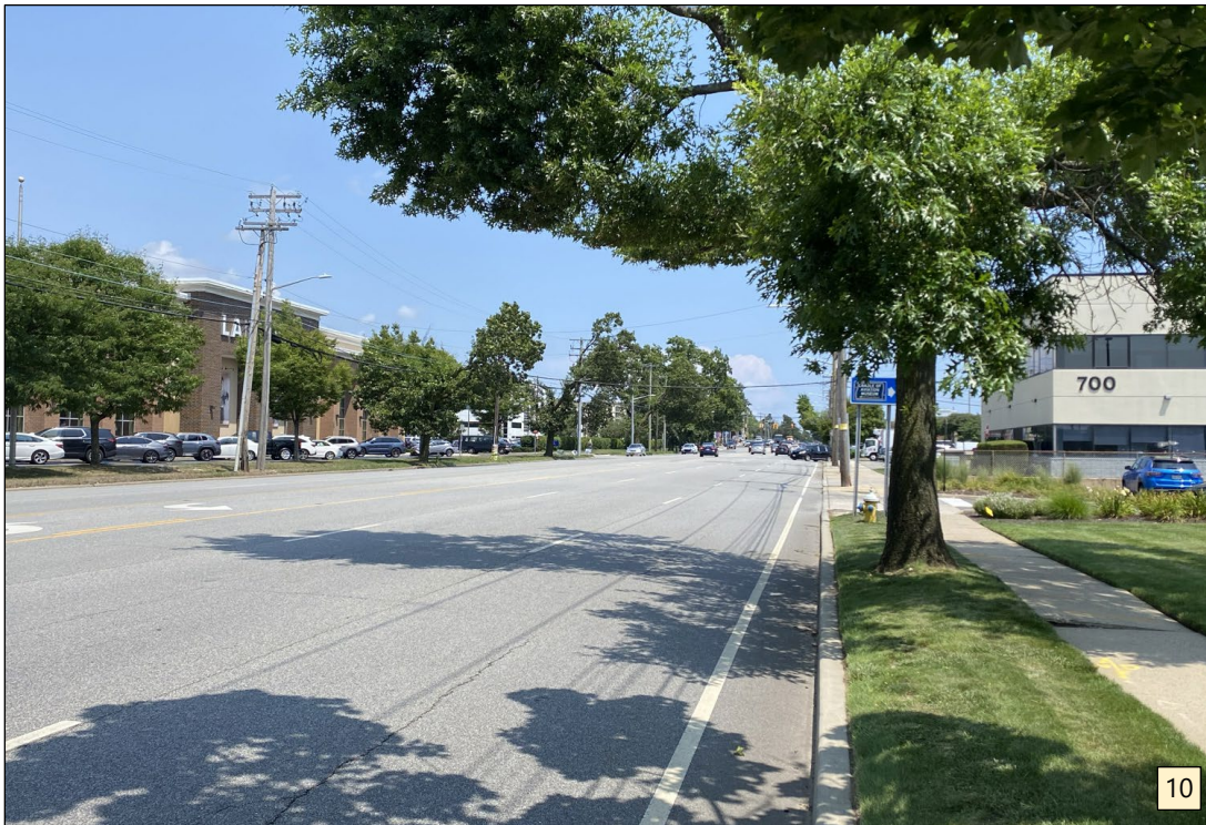
View looking east along Stewart Avenue, north of the Stewart Plaza Shopping Center.