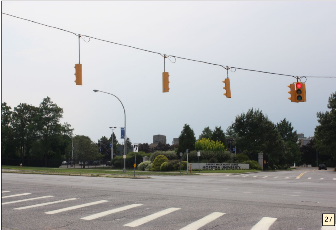
View looking west towards the eastern entrance of Hofstra University from the southwestern corner of the subject property.

1255 Hempstead Turnpike and 101 James Doolittle Boulevard, Uniondale, Town of Hempstead, Nassau County