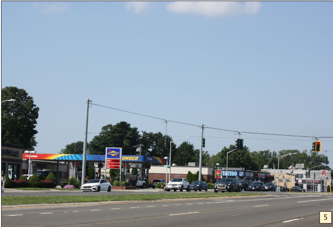
View looking southwest along the Hempstead Turnpike corridor from the southern portion of the subject property.

1255 Hempstead Turnpike and 101 James Doolittle Boulevard, Uniondale, Town of Hempstead, Nassau County