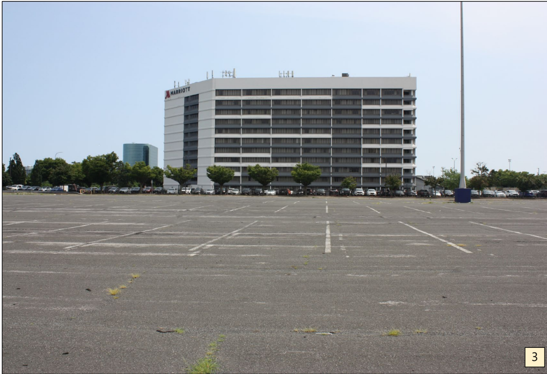
View on the subject property looking south towards the existing Marriott Hotel.

1255 Hempstead Turnpike and 101 James Doolittle Boulevard, Uniondale, Town of Hempstead, Nassau County