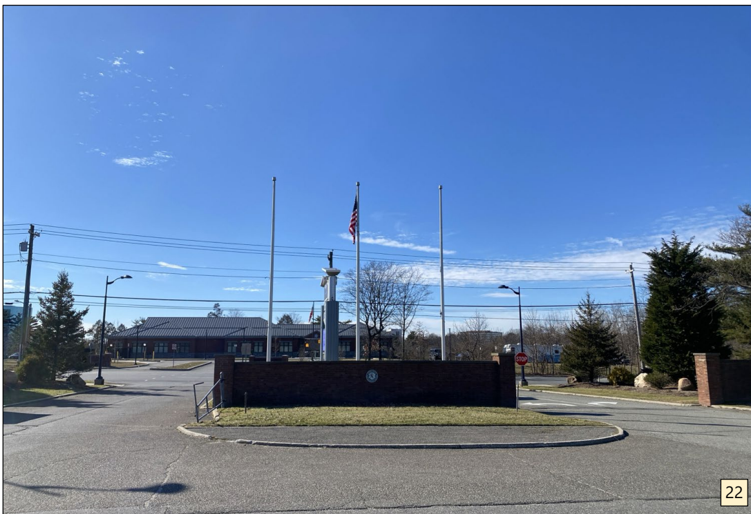
View looking west towards the subject property from the southwestern entrance of Eisenhower Park, which is the closest entrance to the subject property.