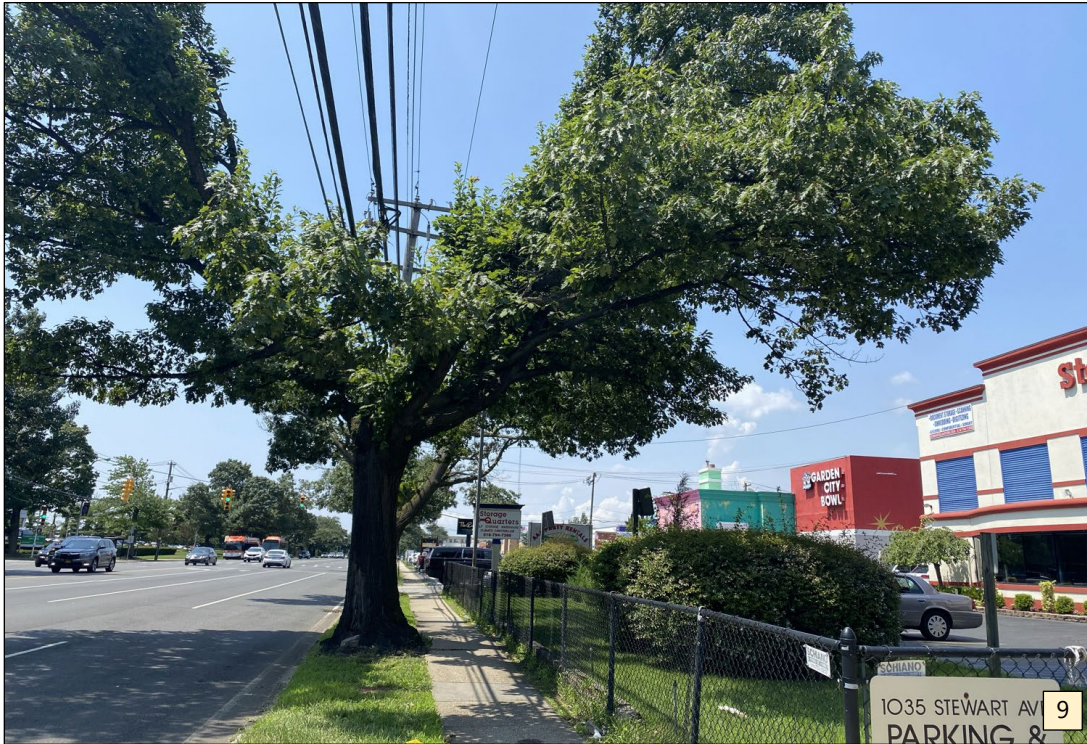
View looking west along the north side of Stewart Avenue.

1255 Hempstead Turnpike and 101 James Doolittle Boulevard, Uniondale, Town of Hempstead, Nassau County