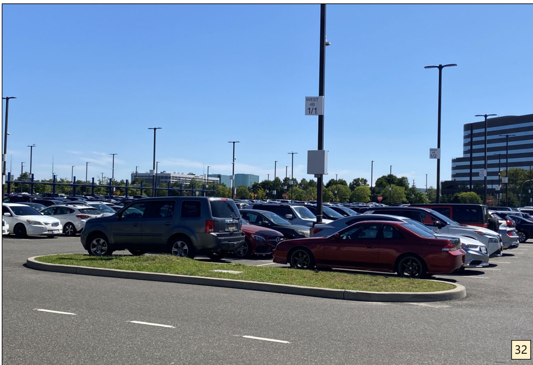
View looking south towards the Subject Property from the NCC Building G parking lot.