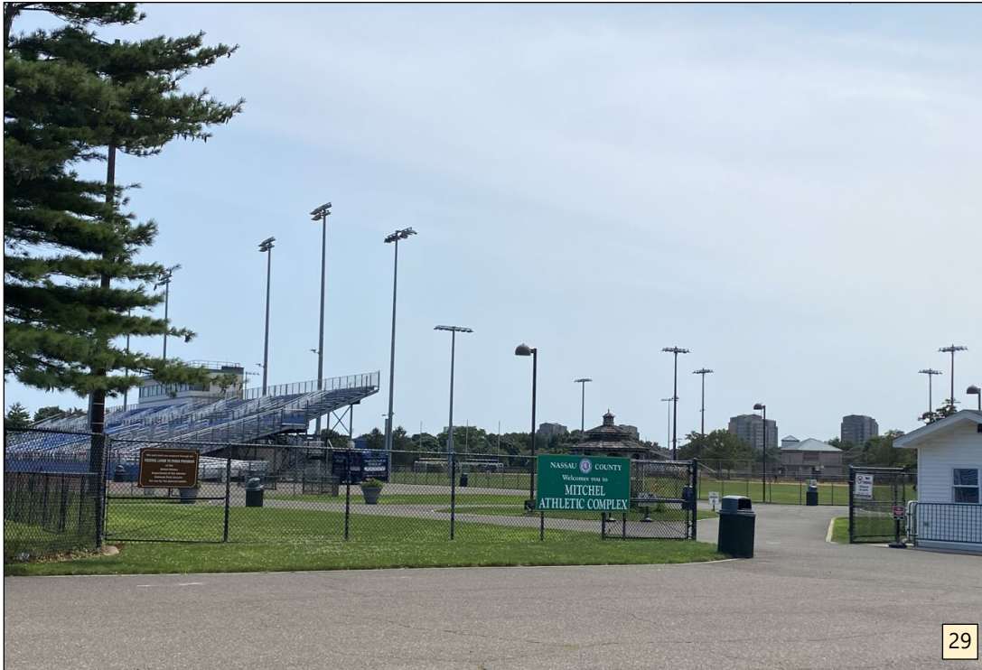
View looking southwest towards Mitchel Field. Buildings from the Hofstra University campus are visible beyond the fields.

1255 Hempstead Turnpike and 101 James Doolittle Boulevard, Uniondale, Town of Hempstead, Nassau County