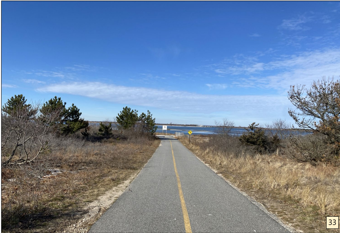
View looking north towards the Subject Property from Zach's Bay at Jones Beach State Park.

1255 Hempstead Turnpike and 101 James Doolittle Boulevard, Uniondale, Town of Hempstead, Nassau County