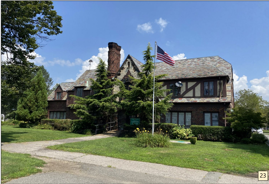
View looking north towards the Staller Mansion/Lanin House within Eisenhower Park.

1255 Hempstead Turnpike and 101 James Doolittle Boulevard, Uniondale, Town of Hempstead, Nassau County