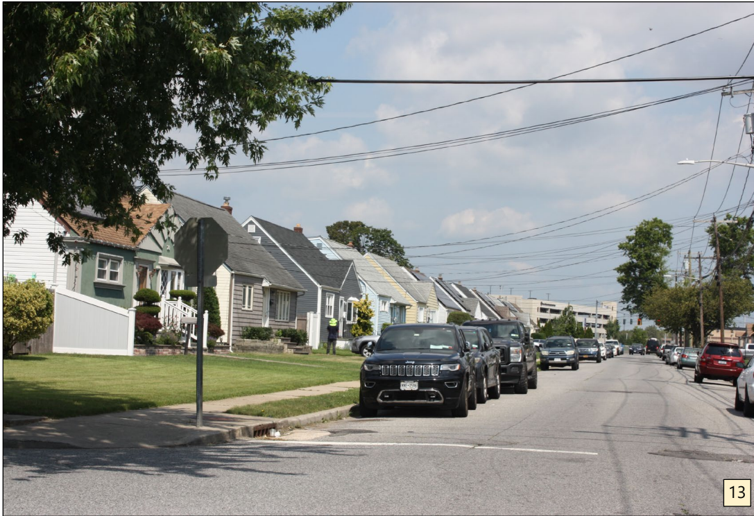
View looking northwest towards the single-family residential homes on Cunningham Avenue.

1255 Hempstead Turnpike and 101 James Doolittle Boulevard, Uniondale, Town of Hempstead, Nassau County