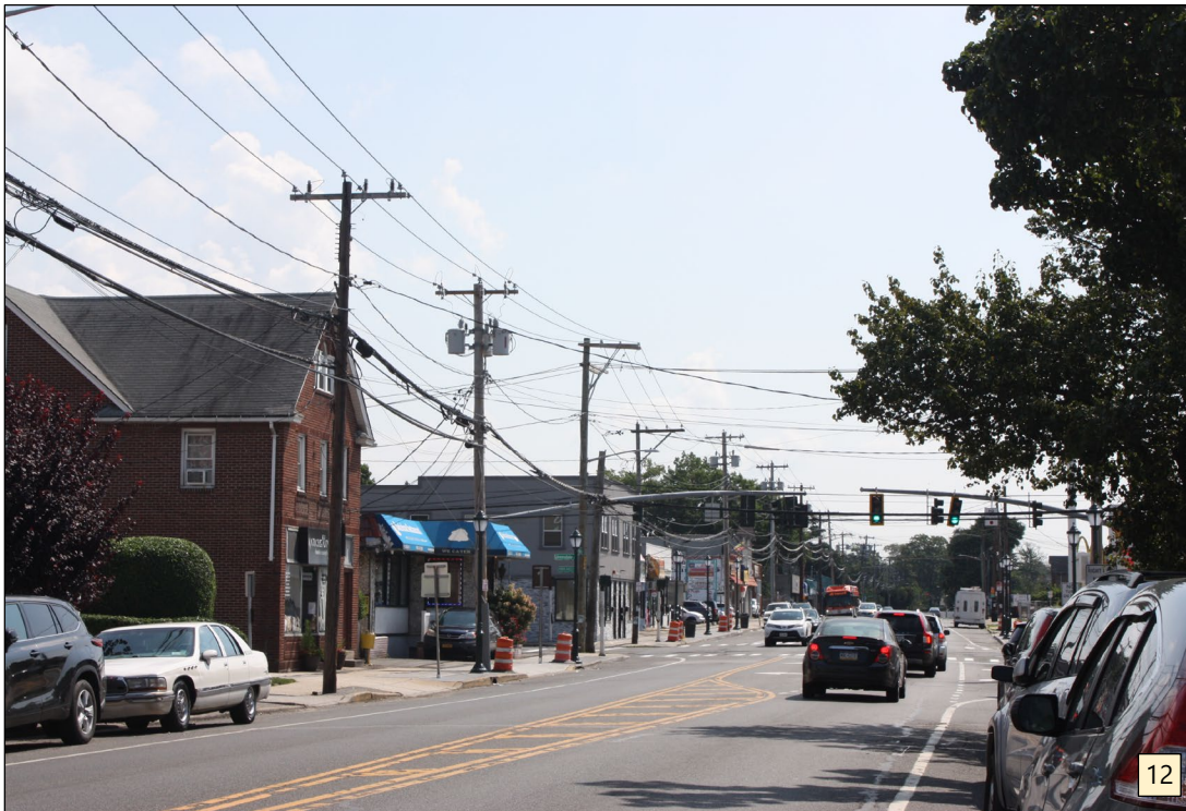
View looking east along Front Street at the intersection of Newport Road.