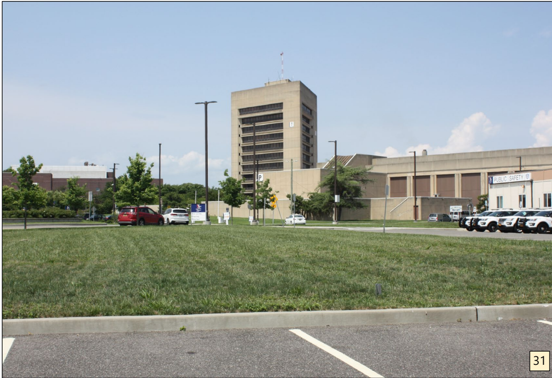
View looking north towards the NCC Tower Building and Building G.

1255 Hempstead Turnpike and 101 James Doolittle Boulevard, Uniondale, Town of Hempstead, Nassau County