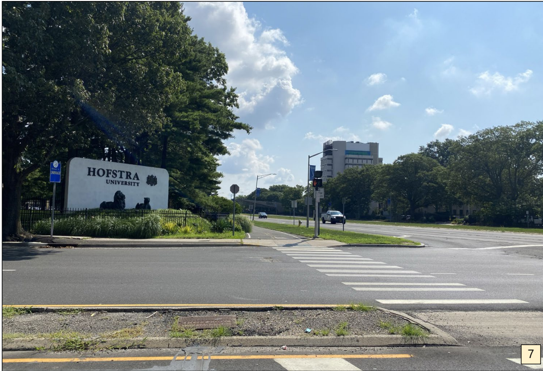
View looking east towards Hempstead Turnpike and the Hofstra University Axinn Library from the intersection of Oak Street.

1255 Hempstead Turnpike and 101 James Doolittle Boulevard, Uniondale, Town of Hempstead, Nassau County