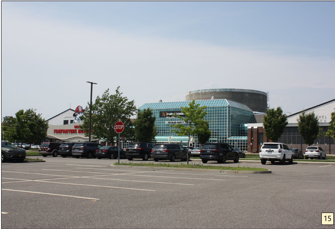
View looking northwest towards the Cradle of Aviation Museum and Nassau County Firefighters Museum within Museum Row.

1255 Hempstead Turnpike and 101 James Doolittle Boulevard, Uniondale, Town of Hempstead, Nassau County