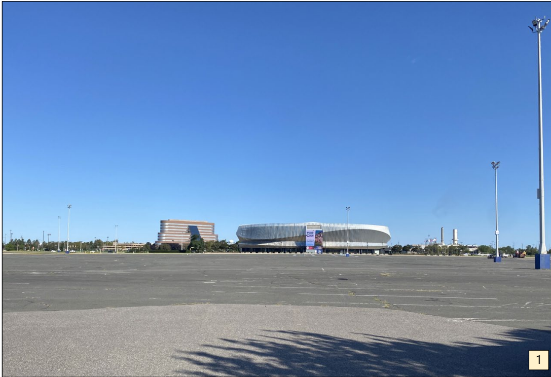
View of the subject property looking south towards the existing Coliseum building.

1255 Hempstead Turnpike and 101 James Doolittle Boulevard, Uniondale, Town of Hempstead, Nassau County