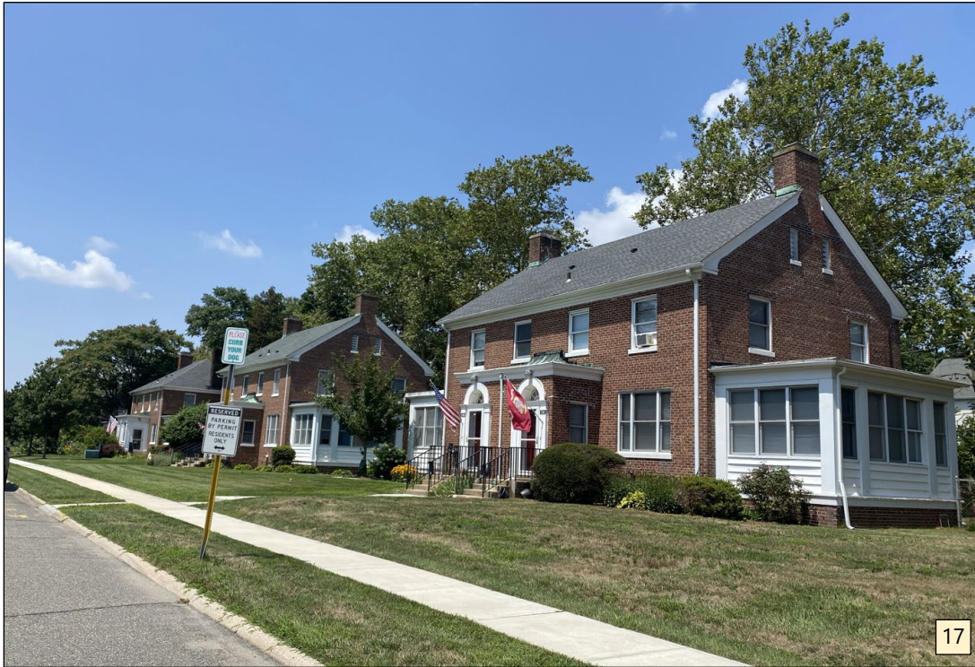
View looking west towards the Officers' Quarters on Wheeler Avenue.

1255 Hempstead Turnpike and 101 James Doolittle Boulevard, Uniondale, Town of Hempstead, Nassau County