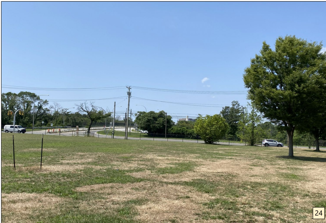
View looking southwest towards the subject property from the Staller Mansion/Lanin House, which is the closest resource to the subject property within Eisenhower Park.