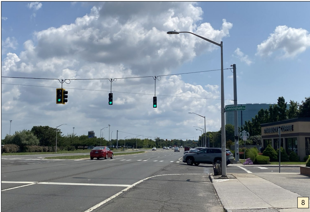
View looking east towards Hempstead Turnpike at the intersection of Cunningham Avenue.