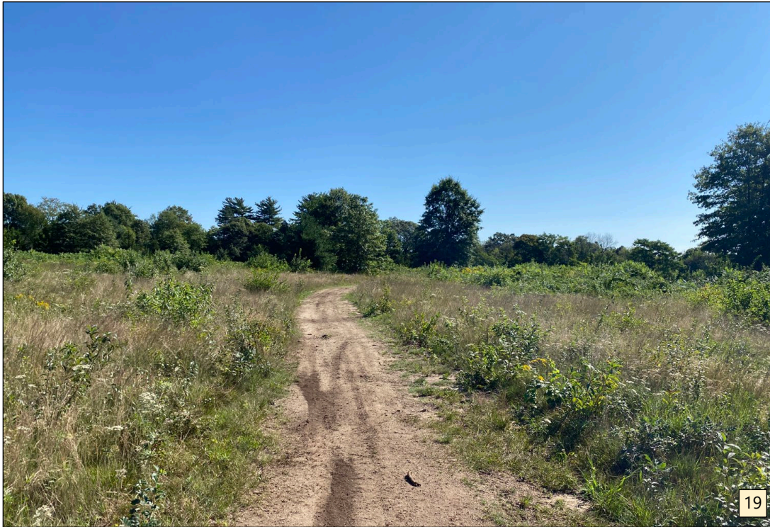
View looking east towards the Francis T. Purcell Preserve (Hempstead Plains).

1255 Hempstead Turnpike and 101 James Doolittle Boulevard, Uniondale, Town of Hempstead, Nassau County