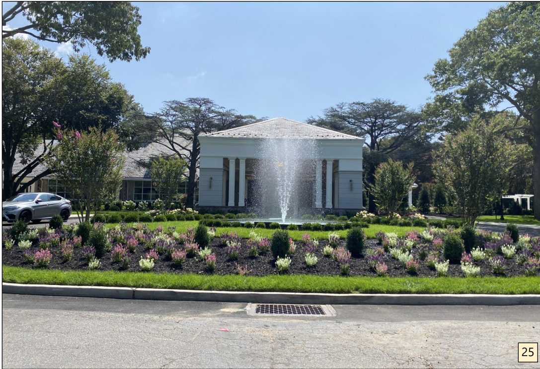
View looking southeast towards the Carlton (former Salisbury Golf Course Clubhouse) within Eisenhower Park.

1255 Hempstead Turnpike and 101 James Doolittle Boulevard, Uniondale, Town of Hempstead, Nassau County