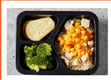
Dinner in Container