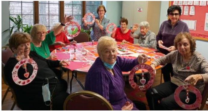
Members of the Wantagh Senior Center make Valentine's Day wreaths