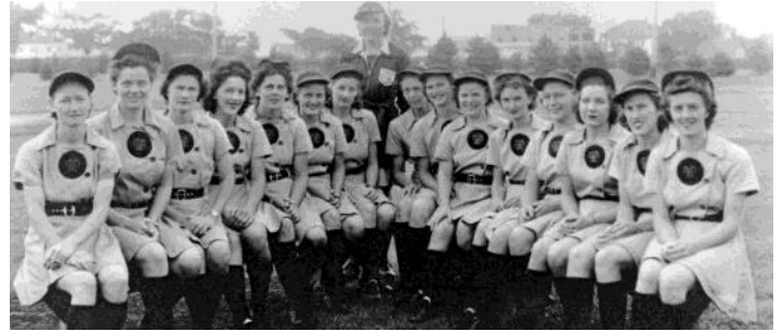
The All American Girls League launched in 1943.

More than 500 major leaguers, including 37 future Hall of Famers, served in the armed forces during World War II. Now known as the "Green Light Letter", then President Franklin Delano Roosevelt encouraged play to continue to bolster morale during difficult times.