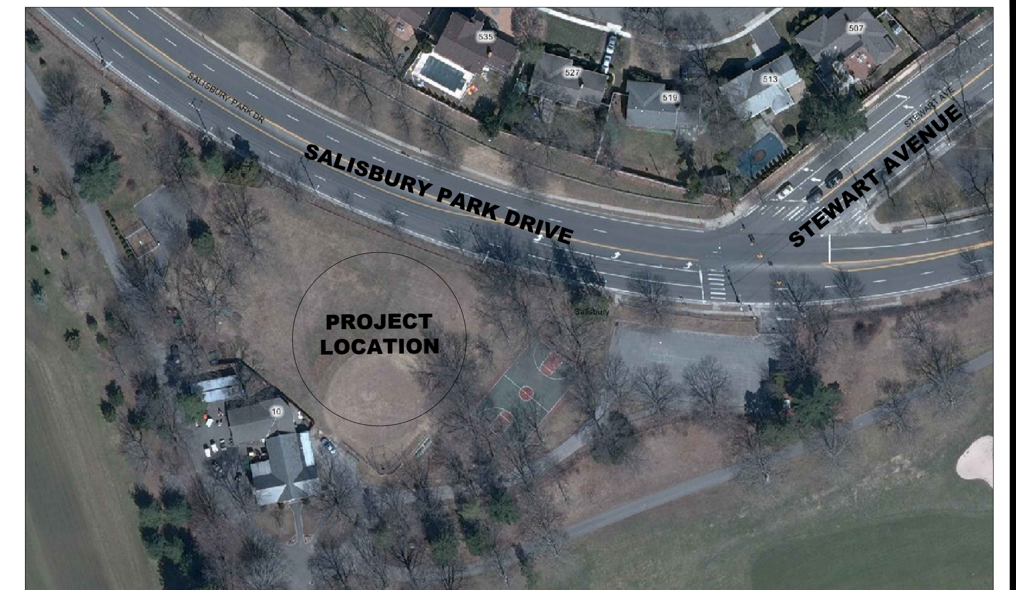
AREA MAP - NOT TO SCALE