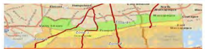
FLOOD ZONE MAP