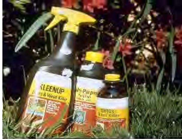
The use of pesticides, such as those pictured here, should be limited to avoid runoff contamination