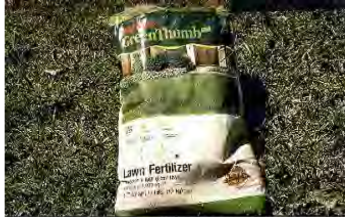
Applying too much lawn fertilizer can significantly contribute to water quality problems

This management measure seeks to control the storm water impacts of landscaping and lawn care practices through education and outreach on methods that reduce nutrient loadings and the amount of storm water runoff generated from lawns. Research has indicated that nutrient runoff from lawns has the potential to cause eutrophication in streams, lakes, and estuaries (CWP, 1999a, and Schueler, 1995a). Nutrient loads generated by suburban lawns as well as municipal properties can be significant, and recent research has shown that lawns produce more surface runoff than previously thought (CWP, 1999b). Pesticide runoff (see Pest Control fact sheet) can contribute pollutants that contaminate drinking water supplies and are toxic to both humans and aquatic organisms.