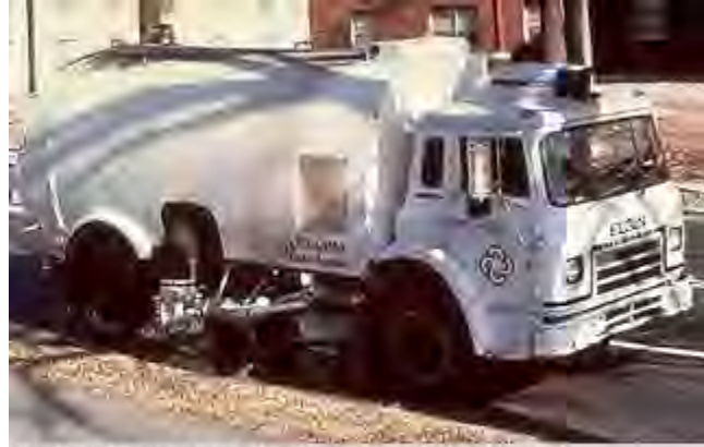
A street sweeper cleans up pollutants and sediments on the street to reduce the amount of pollutants entering receiving waters

This management measure involves employing pavement cleaning practices such as street sweeping on a regular basis to minimize pollutant export to receiving waters. These cleaning practices are designed to remove from road and parking lot surfaces sediment debris and other pollutants that are a potential source of pollution impacting urban waterways (Bannerman, 1999). Although performance monitoring for the Nationwide Urban Runoff Program (NURP) indicated that street sweeping was not very effective in reducing pollutant loads (USEPA, 1983), recent improvements in street sweeper technology have enhanced the ability of present day machines to pick up the fine grained