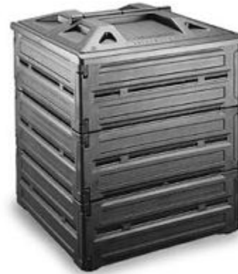
A typical composting bin

Lawn and garden activities can contaminate stormwater with pesticide, soil, and fertilizer runoff. Proper landscape management, however, can effectively reduce water use and contaminant runoff, and enhance a property's aesthetics. Environmentally friendly landscape management protects the environment through careful planning and design, routine soil analysis, appropriate plant selection, use of practical turf areas and mulches, efficient water use, and appropriate maintenance.