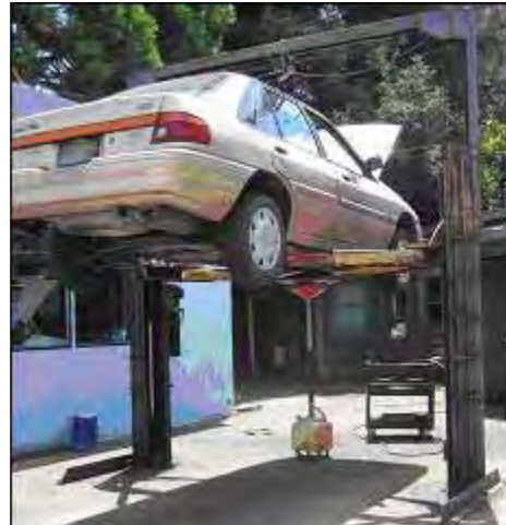
This small auto repair shop performs work outdoors without a roof and without berms or other containment for spills, which increases the threat of stormwater pollution.

Municipal activities require the use of various vehicles and equipment, such as public works operation and maintenance vehicles, police cars, fire trucks, and school and public transit buses. Maintenance facilities may be located at several municipal facilities. An estimated 180 million gallons of used oil is improperly disposed of annually (Alameda CCWP, 1992), and just a single quart of motor oil can pollute 250,000 gallons of drinking water. For this reason, automotive maintenance facilities' discharges to storm and sanitary sewer systems are highly regulated. For more information on educating the public and commercial businesses about vehicle maintenance, see the Stormwater Outreach for Commercial Businesses fact sheet.