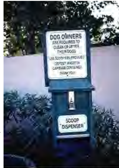
Animal waste dispensers can increase waste collection by providing a convenient method for disposal

Pet waste collection as a source control involves using a combination of educational outreach and enforcement to encourage residents to clean up after their pets. The presence of pet waste in storm water runoff has a number of implications for urban stream water quality, with perhaps the greatest impact from fecal bacteria. According to recent research, nonhuman waste represents a significant source of bacterial contamination in urban watersheds. Genetic studies by Alderiso et al. (1996) and Trial et al. (1993) both concluded that 95 percent of fecal coliform found in urban storm water were of nonhuman origin. Bacterial source-tracking studies in a watershed in the Seattle, Washington, area also found that nearly 20 percent of the bacteria isolates that could be matched with host animals were matched with dogs. These bacteria can pose health risks to humans and other animals and result in the spread of disease. It has been estimated that for watersheds of up to 20 square miles draining to small coastal bays, 2 or 3 days of droppings from a population of about 100 dogs would contribute enough bacteria and nutrients to temporarily close a bay to swimming and shellfishing (USEPA, 1993).