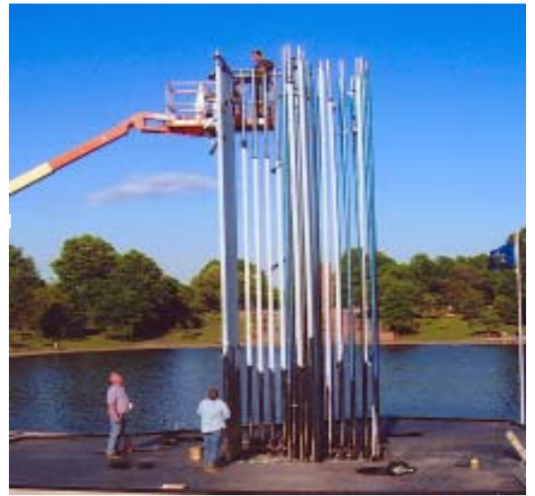
A Labor of Love...