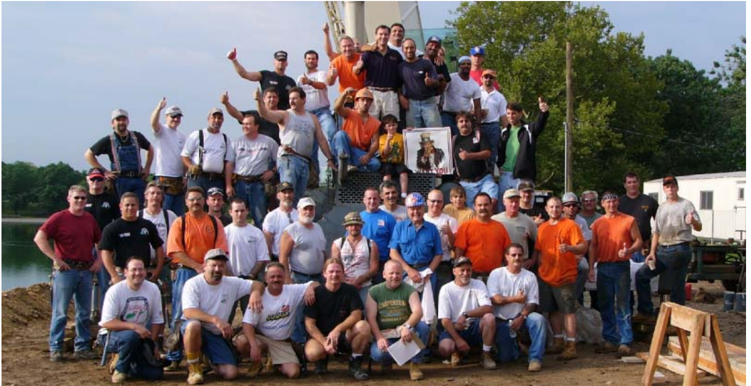
Volunteerism, Team Work, Hard Work & Devotion...Nassau County At Its Best!