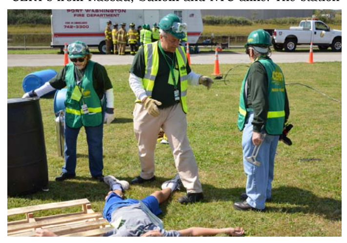
had Chemical drums with different Placards, Victims and other Hazards not to mention Downed Electrical

On September 30th we held our annual Fall exercise and this year we introduced a new Situation Awareness Training Station designated Field Hazard or as it came to be known the "Obstacle Course". I am happy to report that it seems to have been a big hit with the CERT's from Nassau, Suffolk and NYC alike. The station