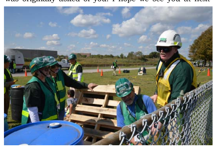
years Exercise! And a big thank you to ever it was that kept the rain away till the very end the Exercise!

lines with the dead crow a crowd favorite! And a "special thanks" must go out to our Victims who where outstanding and enthusiastically played the role of both live and yes dead victims. And also took on the roll of resetting the station! Thank You for going above and beyond what was originally asked of you! I hope we see you at next